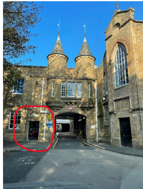
White Cross Gatehouse

We are situated directly above Reception, the door to which you can see to the left of this picture.